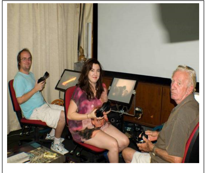
Film Viewing Lab